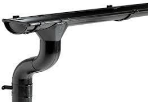
lindab rainwater goods finished in Black (RAL 9011)