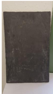
natural slate roof finish – Cupa-H Spanish slates