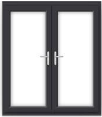
composite French door pair, external colour RAL7016, anthracite grey by approved manufacturer