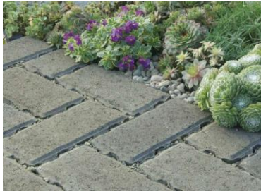
charcoal coloured paviors – pavedrive by Stonemarket