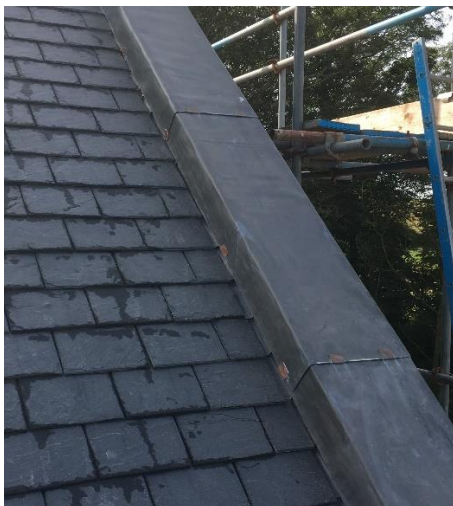
lead clad watertables / skew stones