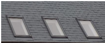
Velux Rooflights – colour black