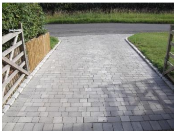
charcoal coloured paviors – pavedrive by Stonemarket or similar approved