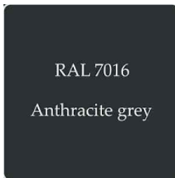
doors + window colour, anthracite grey RAL 7016