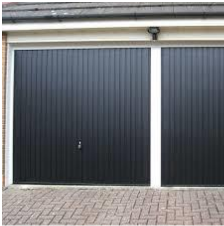
steel doors up and over doors with vertical panels as indicated, colour RAL7016, anthracite grey by approved manufacturer